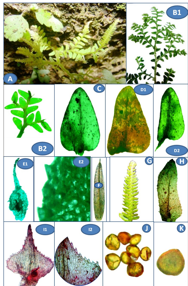
Plate I. Figures (A. Habit, B1-B2. Leaf arrangement, C. Axillary leaf, D1-D2. Lateral leaf, E1-E2. Median leaf, F. Ligule, G. Strobilli, H. Larger sporophyll, I1-I2. Smaller sporophyll, J. Microspore, K. Megaspore).

Plant body ca. 5-20 cm, terrestrial, semi-erect, found growing on the forest floor or on the inclined bases of hills or on the humus deposits on the rock