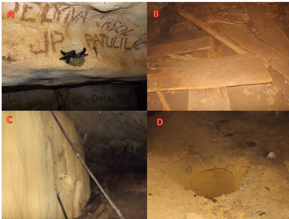
Figure 4. Some of the prevalent disturbances found in caves in Agusan del Sur: (A) Vandalism/Graffiti, (B) remnants of the living quarters in Wilderness/Epheso Cave, (C) Fresh Bamboo pole used for stunning bats and harvesting nests in Wilderness/Epheso Cave, (D) Treasure hunting hole.