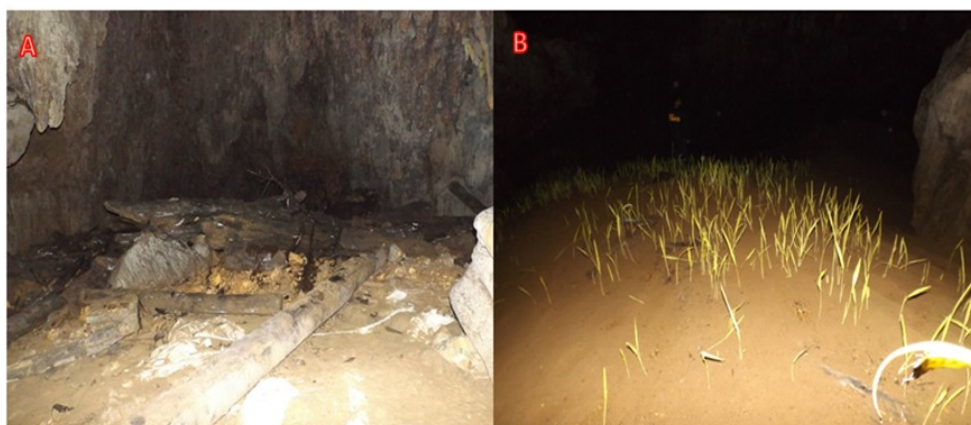
Figure 7. Signs of heavy flooding at Agpan (Paraiso 2) Cave indicated by A) logs and other debris and B) oil palm seedlings.

Katam-isan Cave and Ararat Cave in Barangay Mt. Ararat Bayugan City were both found on a land owned by the Brgy. Captain. Notably, no bats were documented at Katam-isan Cave. This could be due to its proximity to the local community. Furthermore, compared to other caves surveyed, Katam-isan Cave also had the easiest accessibility and easy entrance. Increasing development in areas around cave had been considered as one of the main pressures to bats and other cave inhabitants (Price, 2014). The same observation was noted by