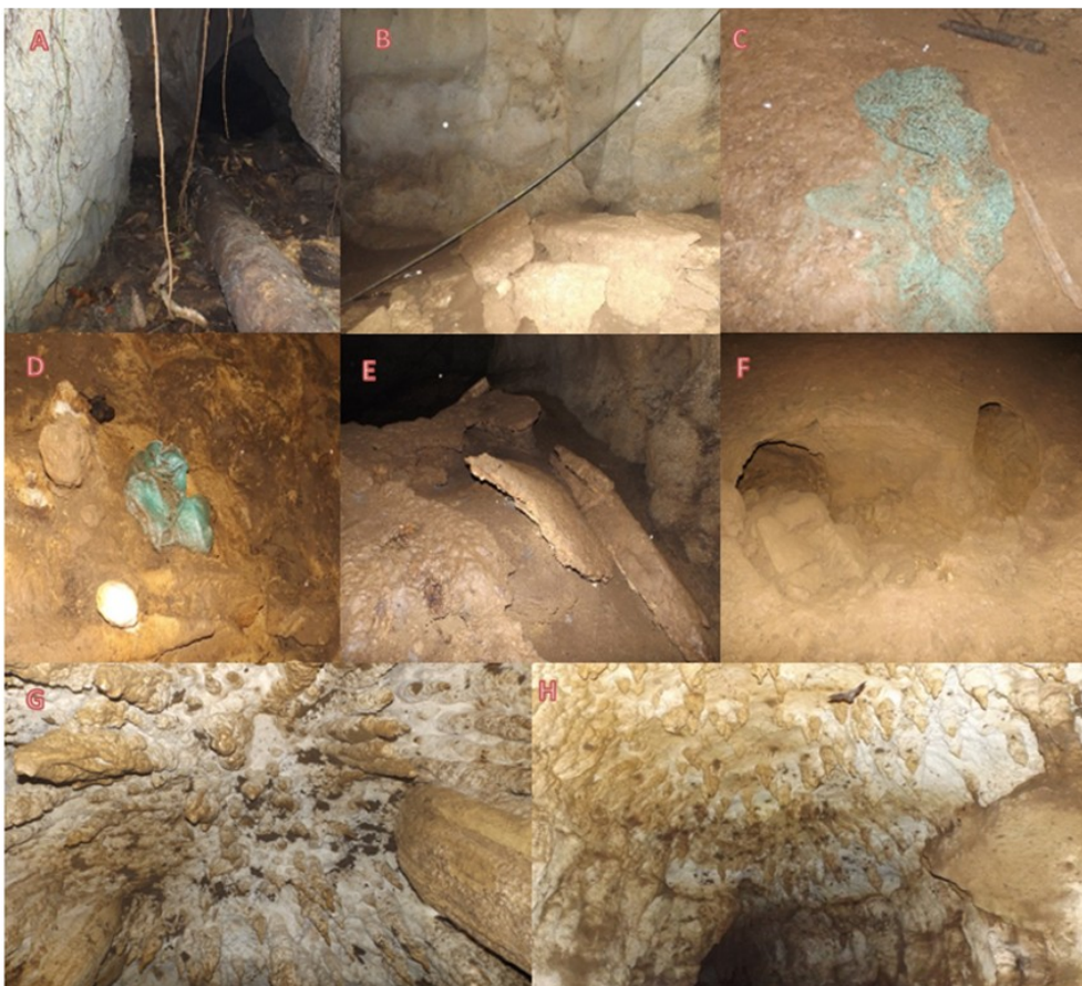
Figure 5. Documented Disturbance in Sampyagit Cave A) Log used to cover the entrance, B) Bamboo pole used for bat hunting and nest collection, C) Mosquito net used as improvised mist net, D) Sack used for guano harvesting, E) Broken rocks due to treasure hunting, F) Treasure hunting excavation, G and H) Mudballs used to stun roosting bats