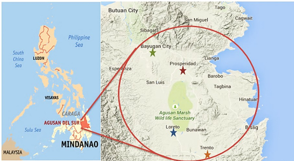
Figure 1. Geographical location of Agusan del Sur and the caves that were assessed.

Legend: ★ Wildemess Cave, Magdaguhong Cave, Ararat Cave, and Katam-isan Cave; ★ Taonaga Cave; ★ Sampyagit Cave, and Simbahan Cave; ★ Agpan (Paraiso 2)