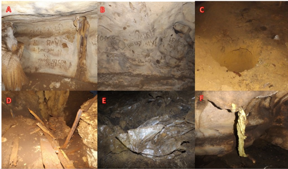
Figure 6. Internal disturbance indicators at Wilderness/Epheso Cave and Magdaguhong Cave – (A) Vandalism/Graffiti at Wilderness Cave and (B) Magdaguhong Cave, (C) Treasure hunting hole at Wilderness Cave and remnants of the utilization of Wilderness Cave as a refuge shelter (D) Logs and posts, (E) Plastic sheet and (F) cloth.

Unit of Loreto is highly essential in order to formulate management plans and programs as well as to educate and empower the Manobo community for cave resource conservation and protection. Section 57 of R.A. 8371 (IPRA) states that the Indigenous Peoples/Indigenous Cultural Communities have the priority rights in the harvesting, extraction, development or exploitation of any natural resources within their ancestral domain, however, it is very important to take into consideration the provisions of DENR Administrative Order No. 04- Cave Management and Conservation Program and Republic Act 9072 – National Caves and Cave Resources Management and Protection Act that mandates the sustainable use and conservation of cave resources. Both Sampyagit Cave and Simbahan Cave could be considered as “significant caves” as defined by Section 3(f) and Section 6 of R.A. 9072 due to their historical, cultural, and ecological values. Sampyagit Cave and Simbahan Cave also serve as roosting sites for a large population of H. diadema that is threatened by the activities of the locals inside the caves. Caves with large bat populations should be given adequate importance to be designated or included in a protected area (Mould, 2012). This further emphasizes the need for both Simbahan Cave and Sampyagit Cave to be given due consideration to protect the large population of H. diadema in these caves from the negative impacts caused primarily by bat hunting and treasure hunting activities.